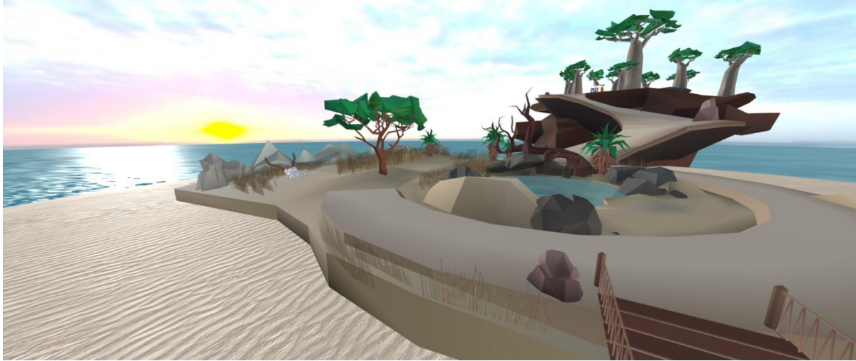
UbuntuLand at dusk