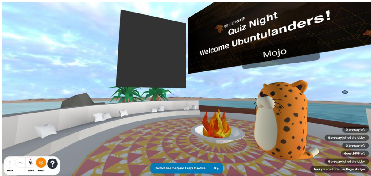
Quiz night in UbuntuLand

I had informal interviews with the participants within UbuntuLand; all individuals were there because they felt excited about what the space offers. Most of the individuals I spoke with were from South Africa, with a few others from Europe, Australia, or the US. The participants from the African continent had predominantly gotten involved because it made them feel proud of their respective countries and continent, and they wanted to “ get in early. ” I felt a sense of community and comradery there too.