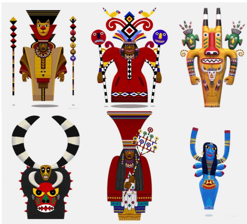
Caricatured avatars, compiled by the author

The initial phase of my research process included investigating the commercial framework behind UbuntuLand, the associated website's language, and discourse, and the site's media and public perception. This work was essential in understanding the power differentials within the address of UbuntuLand that promote its current use and adoption and to which it is attached. Racialized language and symbols are used across UbuntuLand and its associated website. Each avatar group structured hierarchically based on availability is named 'Tribes,' a term in its pejorative sense used to exoticize indigenous individuals and groups. Similarly, the avatars are caricatured sketches with overly ornamented and colonial stereotypical representations symbolizing different African ethnic and cultural groups. UbuntuLand welcomes anybody to "join a tribe," "stake your claim in Africa," and be "an early settler." This language is profoundly imperialistic and displays an entanglement between colonial and digital discourse.