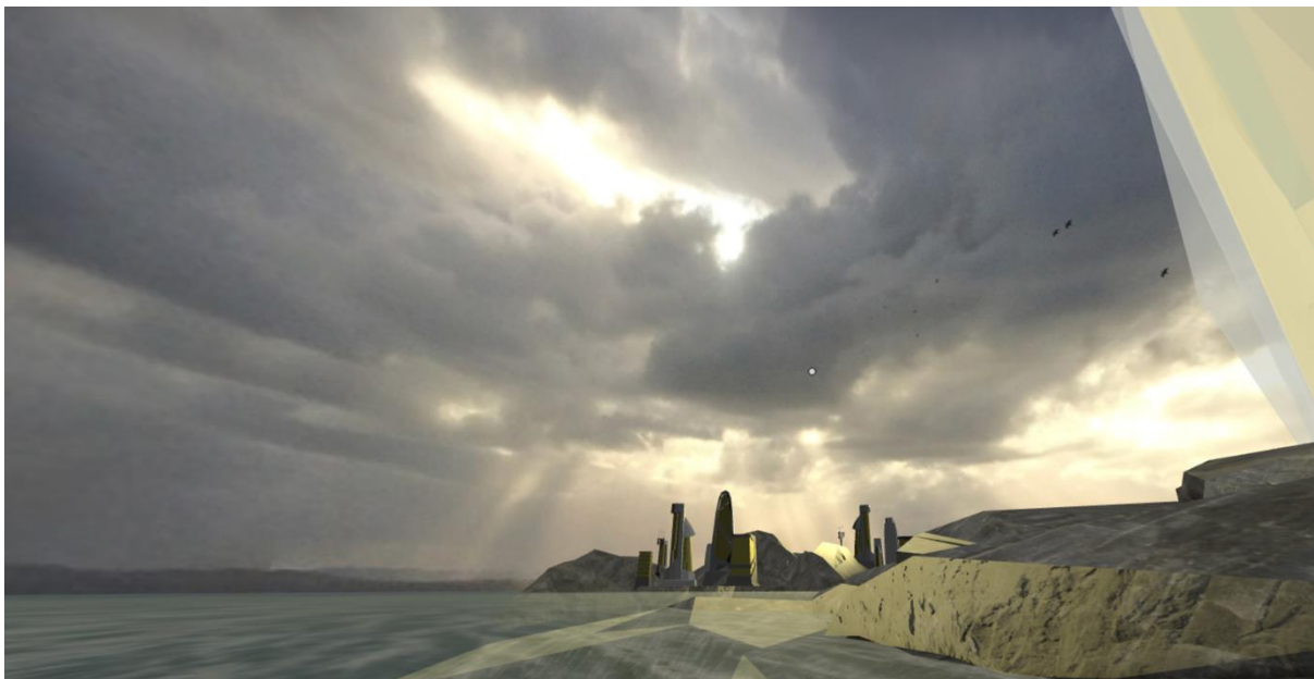
Looking out to sea

It is from this intersection that Ubutuland is paradoxical. On the one hand, it aims to give African artists access to the digital economy and acknowledges power dynamics. Yet, on the other hand, it extends unequal experiences of power concerning intersecting identity markers of race, class, and ability.