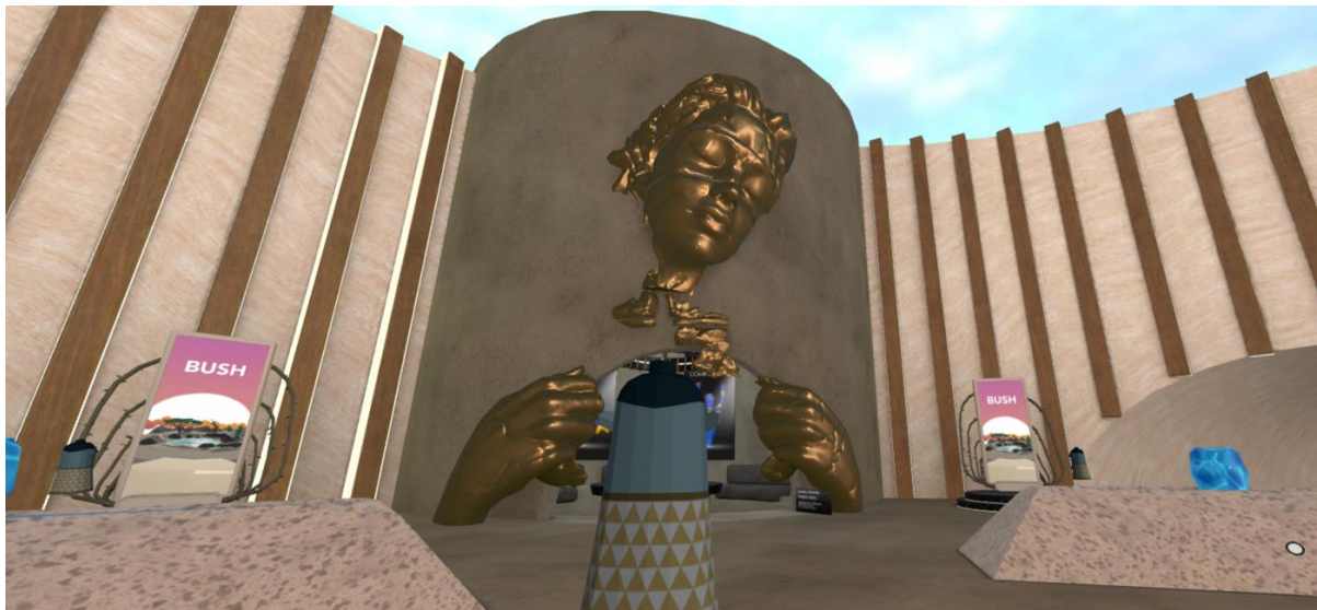
Tribe artwork in the Kraal, captured by the author