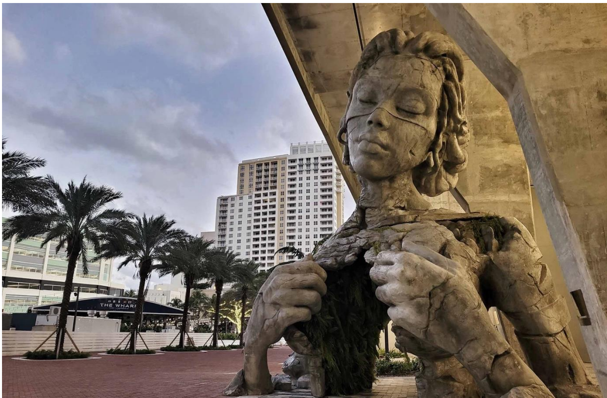
Tribe artwork in Vegas, courtesy of the artist