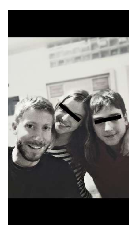
Fig. 7: I also found myself woven into some of these teenagers' online narratives, as they wanted to take selfies with me to share their participation in the project on their social media

This idea of staging/crafting multiple online performances of oneself is often frowned upon by social scientists for "air-brushing one's flaws, telling tall tales, outright lying" (Agger 2015: 7). But in the case of these immigrant youths, there's something extremely empowering about giving them the keys to constructing their own narratives, especially when language, cultural customs and social circles in their country of origin are all absent and unable to give them a much-needed confidence boost.