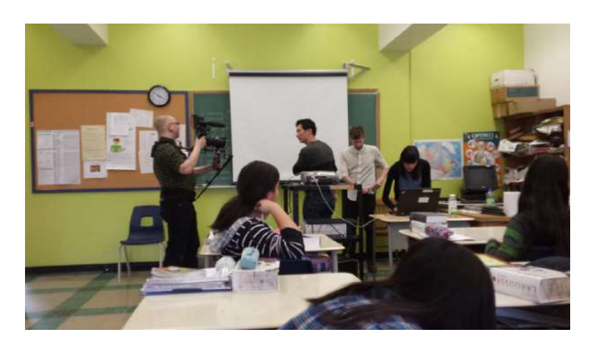
Fig. 3: Me being mic'ed as the Bagages team prepares to film my classroom presentation.

My 13 research participants are all students enrolled in various classes d'accueil at a public high school in the city of Montréal. Their ages range from 12 to 18, and they hail from Iran (5), Moldova (5), Ukraine (1), South Korea (1) and Syria (1). Their native languages are Russian (6), Persian (5), Romanian (4), Korean (1) and Arabic (1). Their high school is among those in the Montréal area that receives the greatest number of students destined for classes d'accueil , as Mélissa Lefebvre, theatre teacher to all my research participants and my main point of contact at the school, explained to me. "The number of immigrant students who go through the classes d'accueil increases every year. We currently have five classes d'accueil , but we're in talks of possibly opening a sixth before the end of the school year, principally as a result of Syrian refugees coming in."