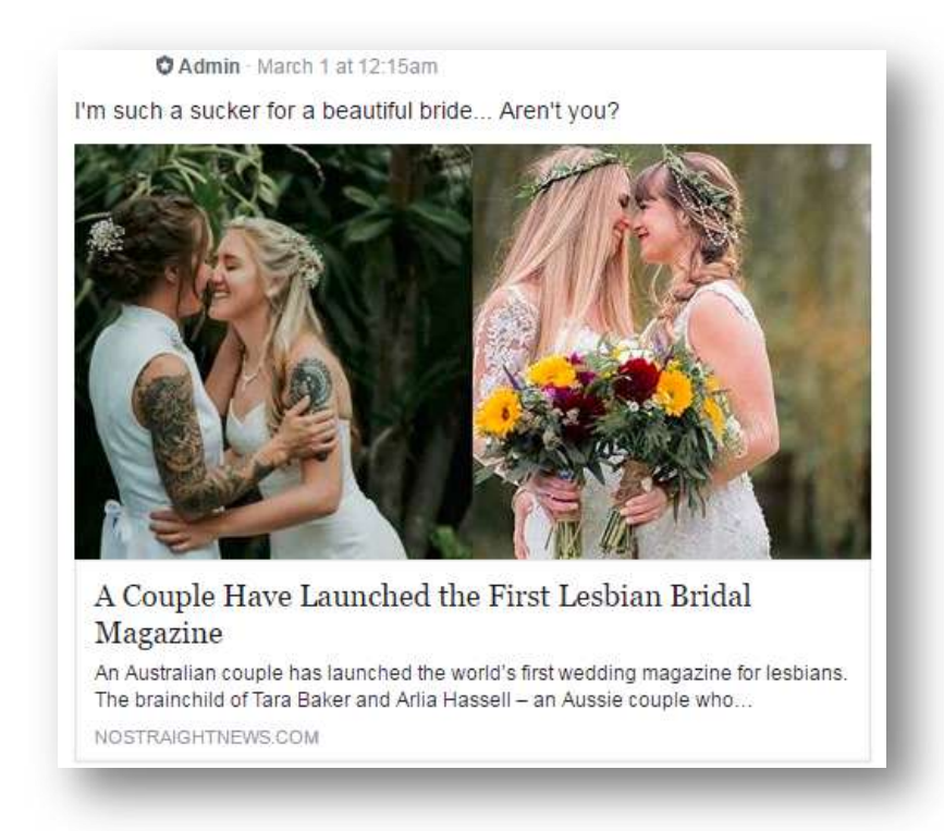
Figure 4: Most popular post during my participant observation: highest number of likes (97) and shares (9).

Prior to beginning participant observation on CTL, I attended an event which came up as "suggested for you" on my Facebook profile, based on my membership in the CTL group. I consider it to be preliminary research, and it highlighted the importance of intersectionality within queer communities. Black Womxn's Voices