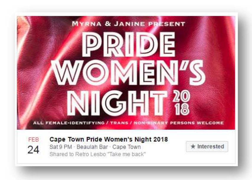
Figure 3: Pride event, hosted at a lesbian bar owned by one of the CTL group admins.