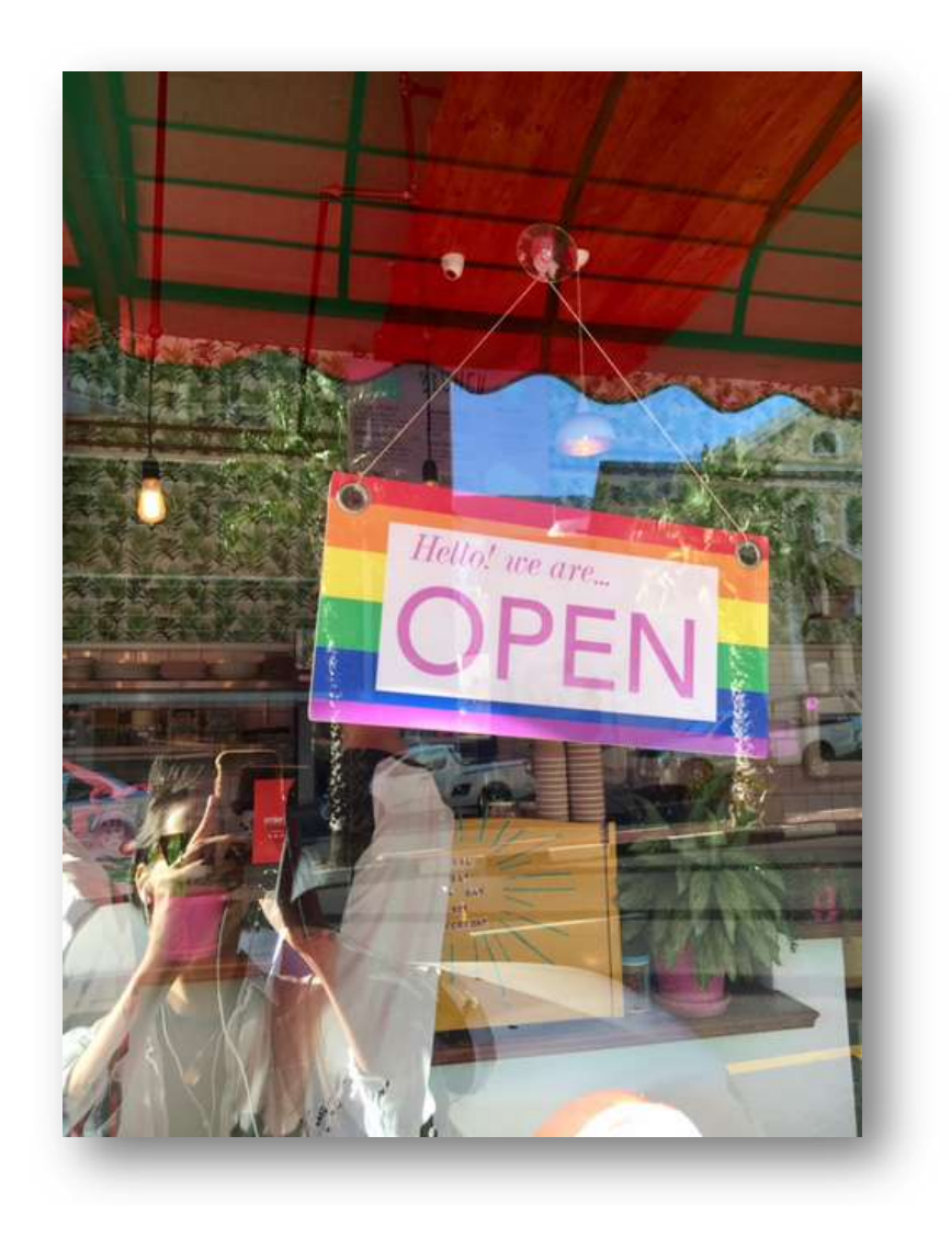
Figure 8: The author exploring queer spaces in Cape Town.