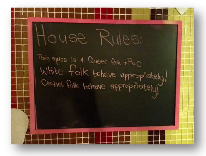
Figure 6: House Rules of the Black Womxn Voices event on the wall in the entrance of event.