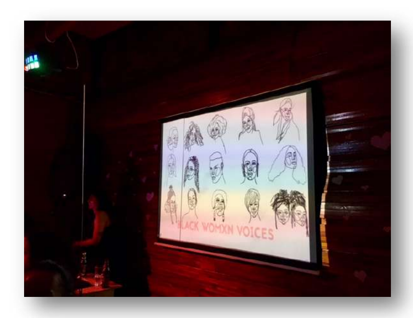
Figure 7: A DJ playing at the Black Womxn Voices event.